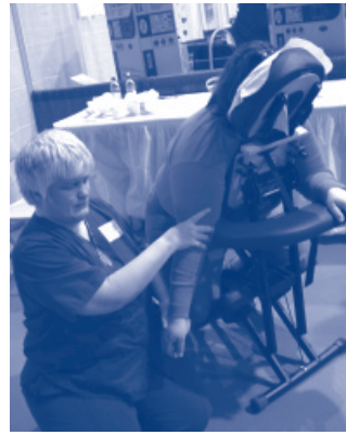
Relax — Get a free massage at the expo.

American 1's Mobile ATM will be on site for hassle-free no surcharge access to your mad money to take advantage of some great deals from the over 120 businesses and organizations attending with 150 booths.